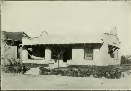
TUCSON, ARIZ. TRINITY, (Manse)